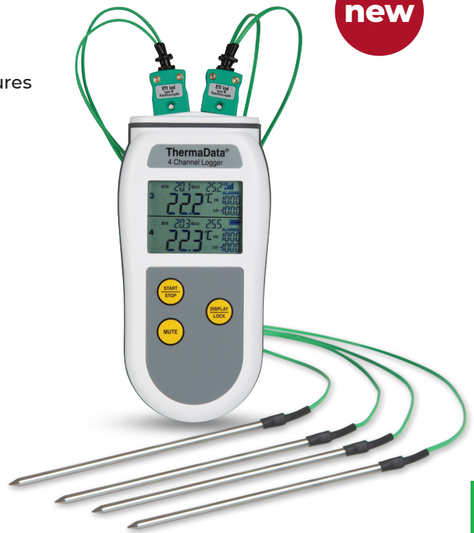
General purpose probe (133-158)

We offer an extensive range of interchangeable type K thermocouple probes for a variety of different applications, see pages 75 to 81.