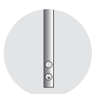
Thermapen IR with air probe (228-114)